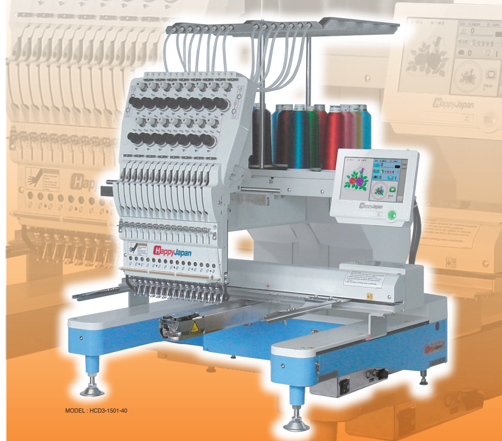
MODEL : HCD3-1501-40